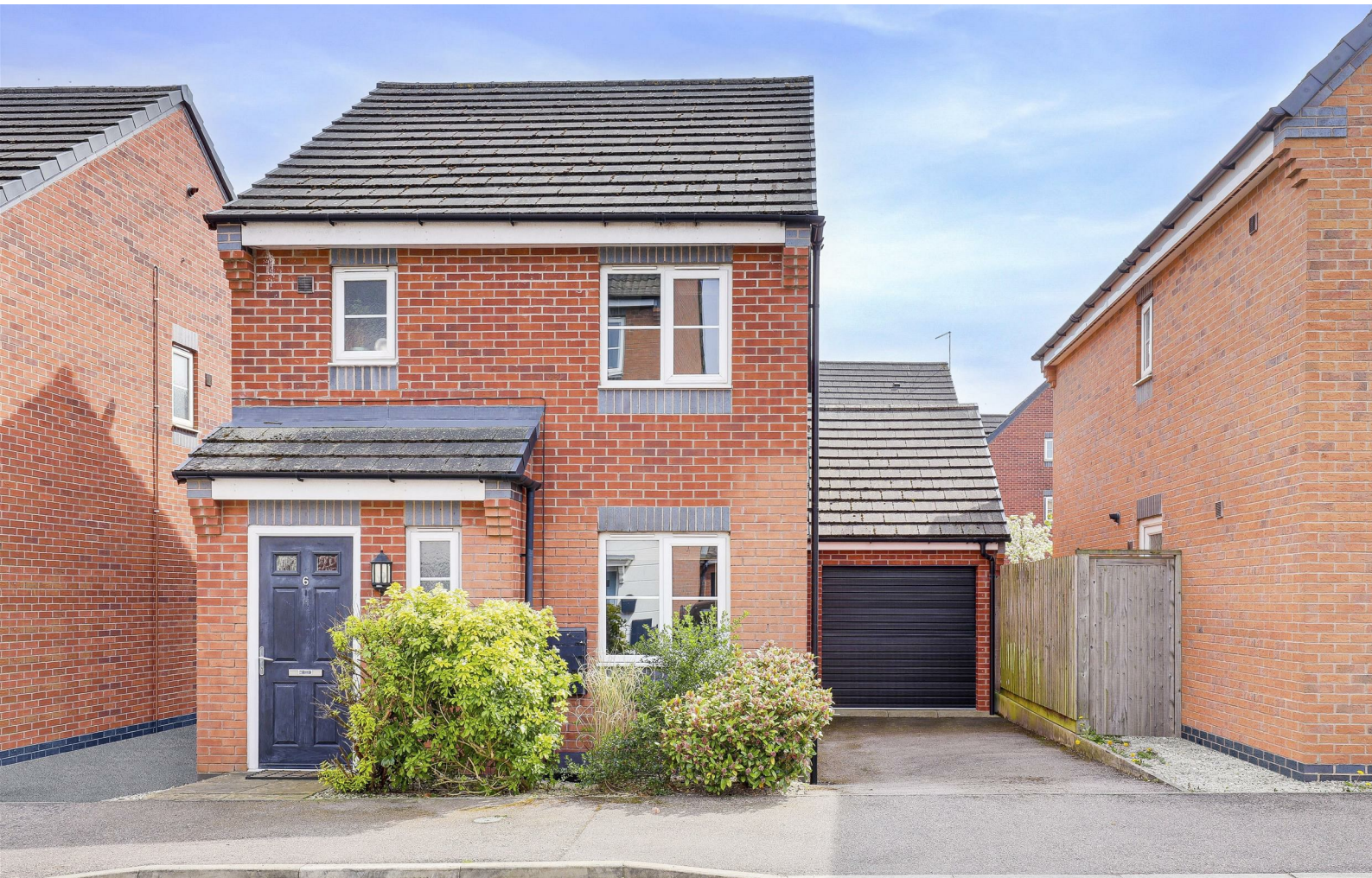
Owston Road, Annesley, Nottinghamshire NG15 0DW